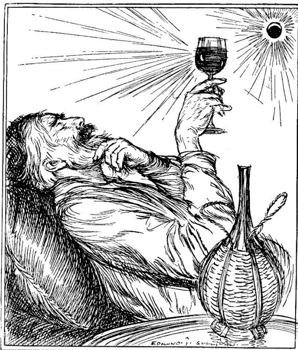
Edmund J Sullivan Illustrations to The Rubaiyat of Omar Khayyam First Version Quatrain-056

Sharia: The Role of Sufism in Shaping Islam (www.beyondsharia.nl), where he studies the intellectual 12 genealogies and the shifting popularity of 'Umar Khayyām's quatrains from the thirteenth to the twentieth century.